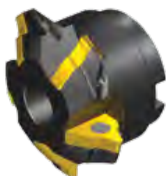
Shell Mill for IC 1/2"U D2=52 & 51 No. of Flutes: 4