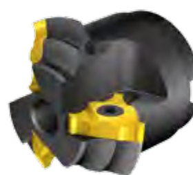
Shell Mill for IC 5/8"U D2=60 No. of Flutes: 3

Please contact me directly with specific questions and requests. For additional updates and news visit the VARGUS website: www.vargus.com